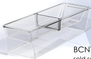
BCNTAJ-2839 fits with V9-2 sold separately