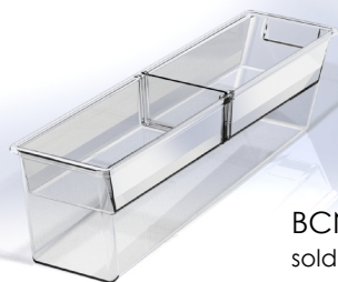
BCNTAJ-2837 fits with V6-2 sold separately